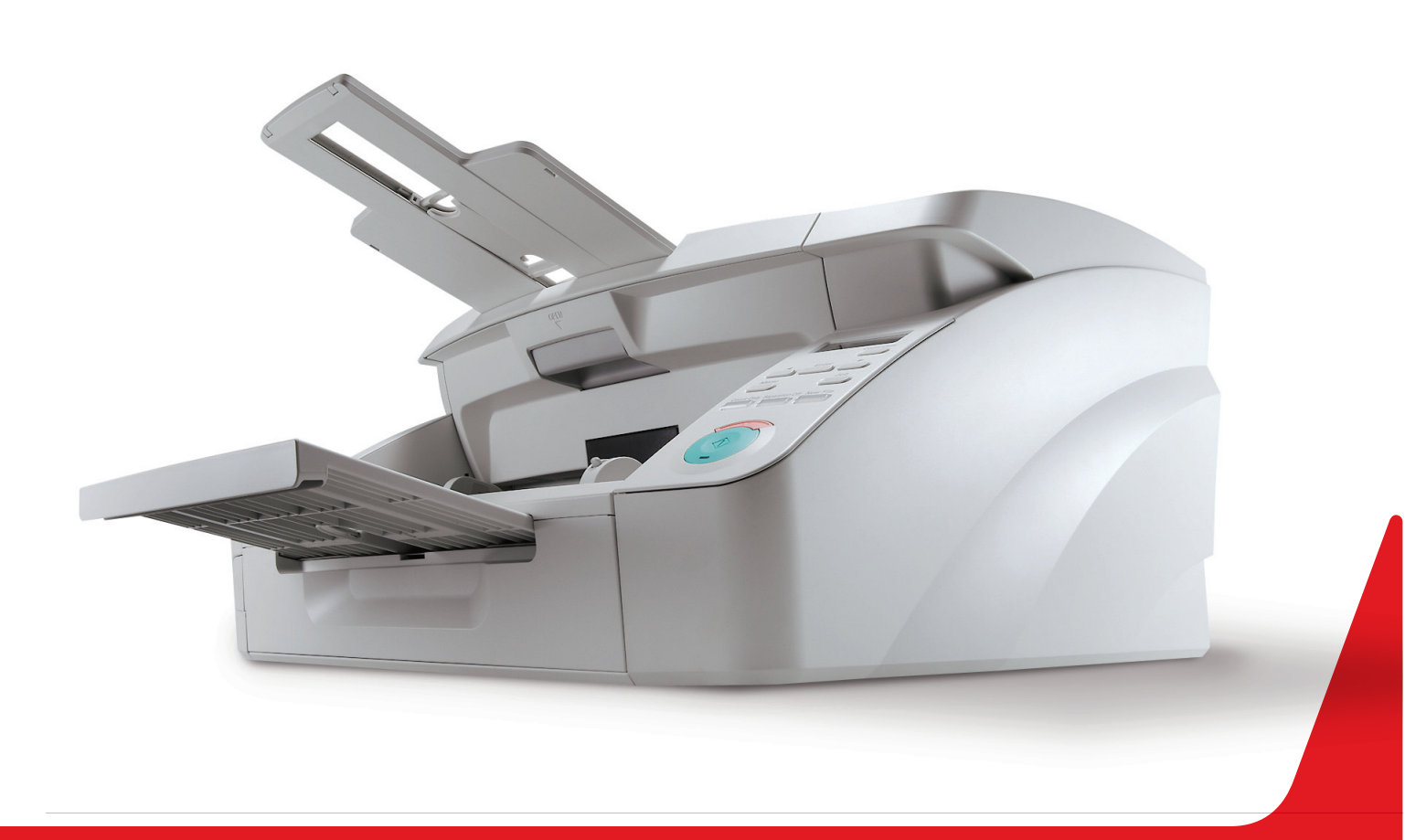
Note: These are suggested daily scanning volumes based on scanning speed and assumed daily time of use.